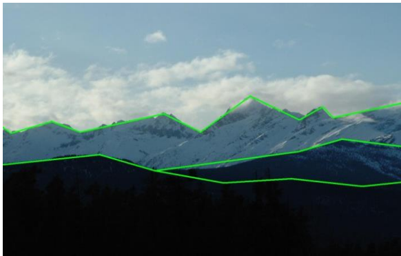
*Inspiration for the Mountain Valley Style

Includes sloped roofs, exposed wood and natural materials for building exteriors including rock, stone, and wood.