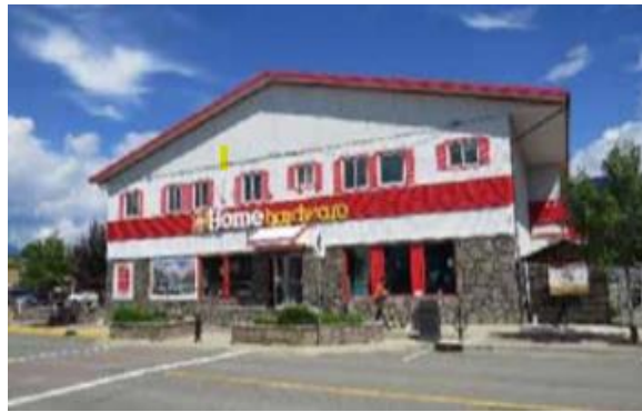
*Example of a Mixed-Use Building with a Sloped Roof and Natural Materials