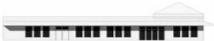
Not recommended: Large, boxy building forms

Building shape should be sufficiently varied to create interest and avoid a monotonous appearance. Long expanses of plain walls are strongly discouraged. Long walls and large boxy forms should be broken into individual sections using roof and façade articulation, and vertical features, to create the appearance of smaller, individual storefronts.